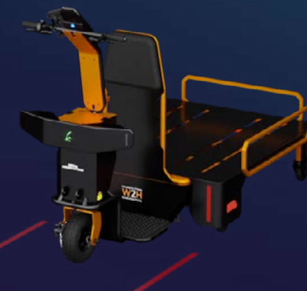
Detachable Load Tray