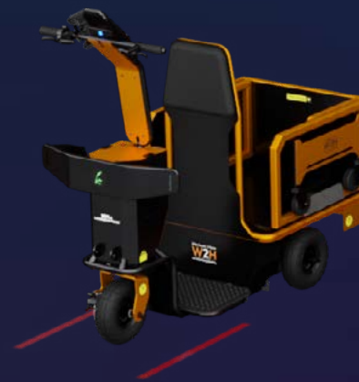
Foldable Load Tray