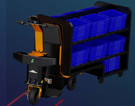
14 Tote Configuration