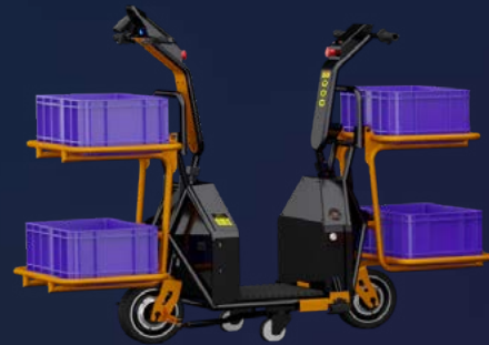
4 Tote Configuration

A Product of Greendzine Technologies Pvt. Ltd.