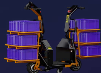
6 Tote Configuration