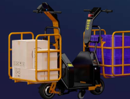
Custom Tote Configuration