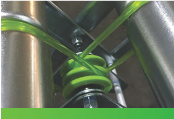
PU O Ring