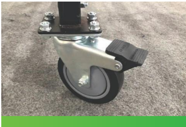
5 inch dia plate type castor wheel