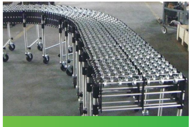
Optional steel skate wheel