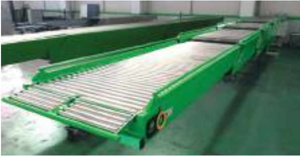
Gravity Roller Telescopic Conveyor