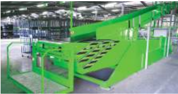
Handling Platform for loading and unloading stand